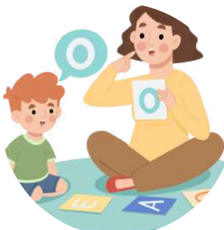
SPEECH AND LANGUAGE THERAPIST